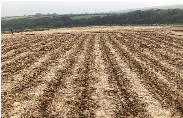
Subsoil preparation works – Code 7 Consulting

Restoration works at the landfill site have made great progress this year despite the late start due to COVID-19 delays.