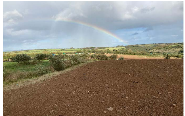
Soil ready for seeding - Code 7 Consulting

Over this winter the trees and shrubs will be planted, starting as soon as the weather dictates the young plants can be uplifted from the nursery.