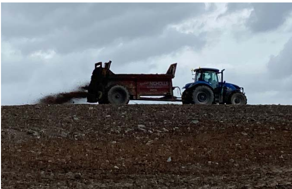
Topsoil spreading – Code 7 Consulting

All capping of the landfill has been completed and most soil placement too, with some soil placement and levelling work remaining to be done at the western end of the landfill in spring 2021 in order to allow the surface water swales to gravity-feed as much of the rainfall as possible to the larger lagoon at the western end of the site.