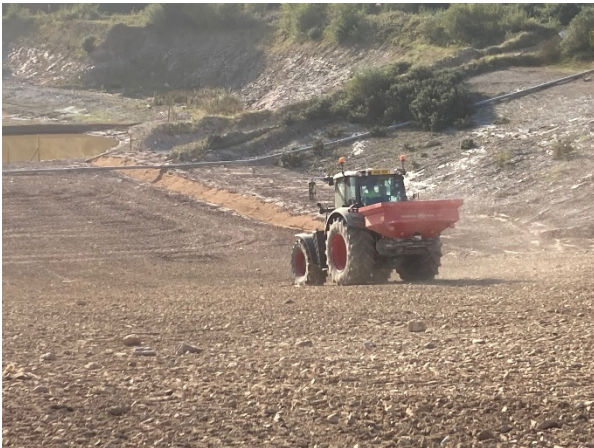
Seeding – Code 7 Consulting

As the tree planting should only be carried out in the winter season, whilst most of it is planned to be done this winter there may also be a need to finish off the tree planting on some areas next winter, so a 'longstop' date of 31st December 2021 will be sought for final completion of any tree planting works.