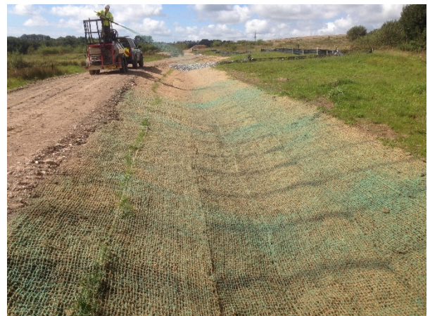
Hydroseeding – Code 7 Consulting

Reptiles and amphibians such as Common Frogs, Toads and Common Lizard have been spotted and insects like butterflies and dragon flies are enjoying the new landscape.